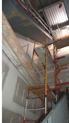
Work continues on the walls in Stair #1 at the south end of the terminal.

rated for storm safety and are accessible by occupants on both the first and second floors. Detailed emergency evacuation procedures and maps will be included in Tenant Manuals, which will be provided to every tenant in advance of their occupancy of the building. In addition to the manuals, Chrysalis will provide all people working in the terminal with building orientation in advance of opening day, in which safety issues will be addressed.