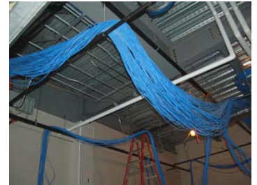
CAT6 cable installation.