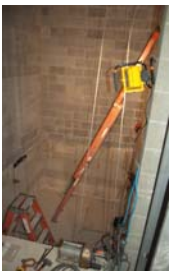
Preparing for installation of Elevator #2.

The new terminal has three elevators, two on the non-secure side and one on the secure side, which will run from the holdroom to the ramp. This elevator and adjacent stair will be used for