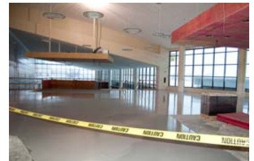
Preparing the floor of the Meeter/Greeter Hall for terrazzo installation.