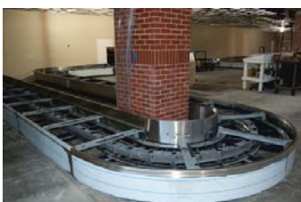
Stainless steel trim installed around bag claim. The white covering will be removed after installation is complete.

Hear a rumor? Contact Ann, athorvik@chrysalisglobal.com