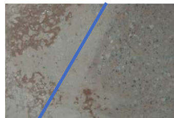
Terrazzo before and after grinding.

ble chips, glass, or metal are poured, they must harden and cure before being ground to a smooth finish, polished, sealed, and buffed. Terrazzo is poured by color, and with ten colors of terrazzo in the new terminal, tile work will continue through January.