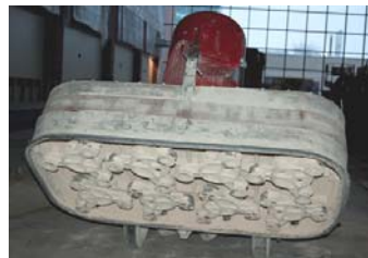
Machine used to grind the terrazzo.

Terrazzo is being poured throughout areas of the terminal. The multi-step process involves priming the concrete floor and placing strips of