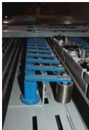
Springs under individual plates of the bag belt.