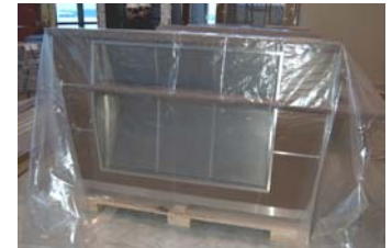
Counters for airline gates are on-site. Ticketing and rental car counters are scheduled to arrive soon.

Each lane will have doors at the boarding area side and the non-secure side. These lanes have sensors that, when combined with security cameras, can analyze the traffic and trigger alarms if items are left in the unit or if traffic attempts to move in the wrong direction.