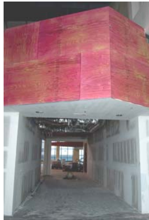
The triple-lane FlipFlow doors will be installed to create the exit lane for passenger traffic.

The new Kalamazoo/Battle Creek International Airport terminal will feature the first US installation of FlipFlow exit lane doors by Great Lakes Automatic Door. Popular in Canada and overseas, this system quickly and safely allows passengers to leave the boarding area. Rather than a revolving door between the boarding area and Meeter/Greeter hall, the new terminal will feature a