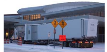
Passenger Boarding Bridges began arriving last week.

There are 82 CCTV cameras planned for the new terminal.