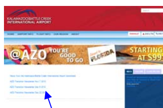
View, print, or save newsletters from the list.