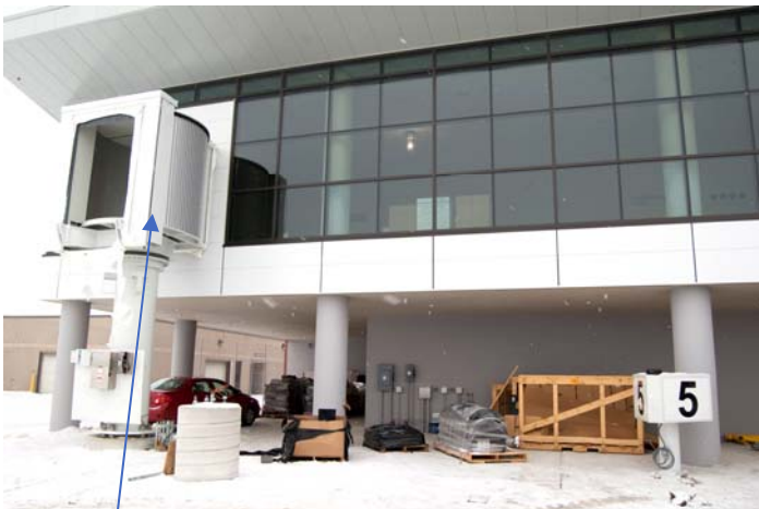
Passenger Boarding Bridge installation has begun. In this photo, the first sections, the rotunda and column, have been installed. It will take five weeks to install and test the five new bridges.