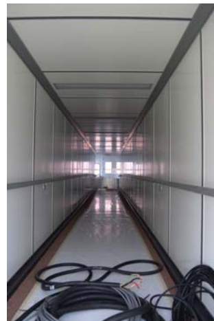
Interior of the Passenger Boarding Bridge's tunnel, prior to installation.