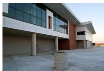
Paving progress on ramp.

ants have been contacted with their new address information to aid in preparations for the move. Please continue to use existing addresses until the official switch-over to the new system.