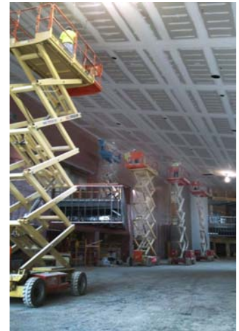
Tradesmen sand the arrivals lobby ceiling in the new terminal.

The newsletter will be distributed by e-mail biweekly and may be printed and posted for airport tenants and employees.