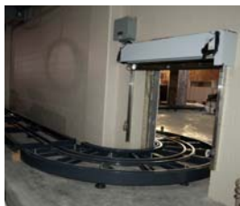
Incoming baggage belt under construction.