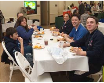
American's staff takes an opportunity to relax.

The Worker Appreciation Event on March 26 was attended by far more families than expected. About 485