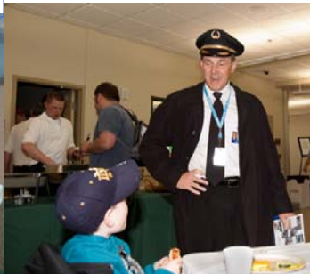
Time to visit between flights.