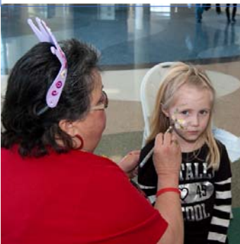
Aunt Penny's Face Painting provided decorations for about 100 children and a few brave adults.

The Worker Appreciation Event on March 26 was attended by far more families than expected. About 485