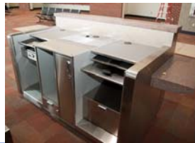
Delta's gate counter inserts were installed last week.

Instead of tossing furniture into the dumpster, please leave it in place and during the physical moves we'll provide you with stickers to identify items for removal. After the physical moves are complete, we'll have a service come through and remove those items for you.