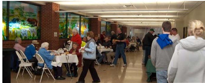
A rare opportunity to have food and beverages in the TSA checkpoint.

people joined in the celebration, including 170 children.